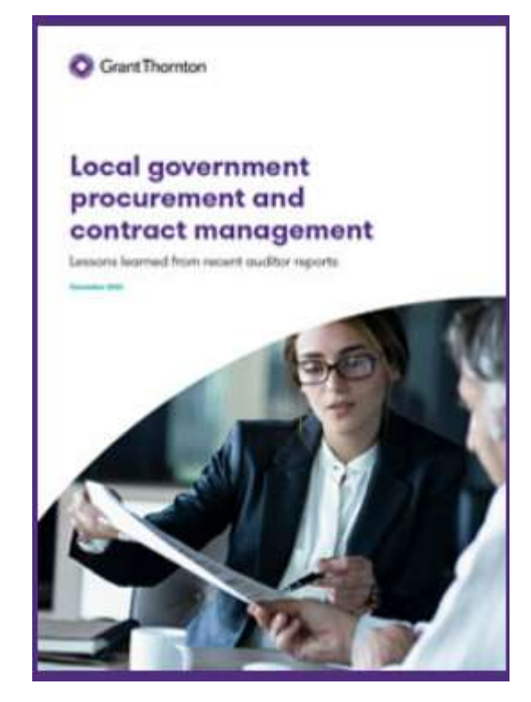
Read the full report here: <u>Local government procurement and contract management:</u> <u>Lessons learned | Grant Thornton</u>